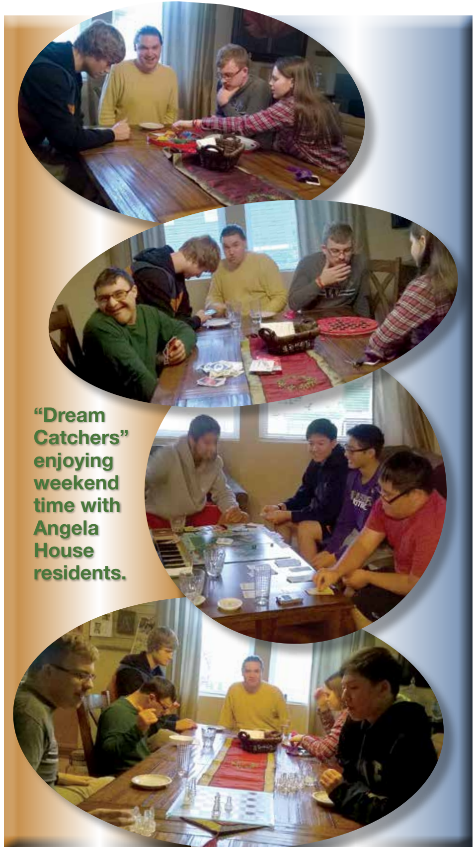
"Dream Catchers" enjoying weekend time with Angela House residents.