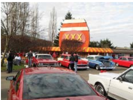
Issaquah's Triple XXX Rootbeer Drive-in.

Please help us help them. Dreams really can come true.