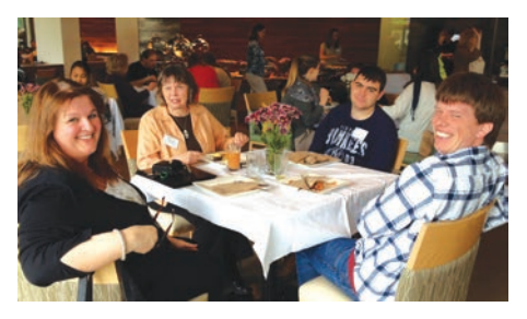
Swedish Issaquah provided the wonderful accommodations of Café 1910 for the Mother's Brunch.

The brunch will be an annual event that will allow families with children with special needs to celebrate this most important holiday – Mother's Day – in a comfortable and accepting environment.